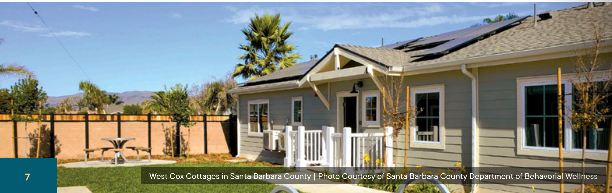
West Cox Cottages in Santa Barbara County

Expenditure rates for Los Angeles and Santa Clara have increased significantly from the previous year. LA's expenditure rate has increased from 27 percent to 55 percent, and Santa Clara's has increased from 6 percent to 36 percent. San Diego's and San Francisco's remain steady at roughly 43 percent of total funds awarded to date (through FY 20-21). Additional draws are expected before the end of the year as more APC projects begin construction. Construction activity data is summarized in Section V.