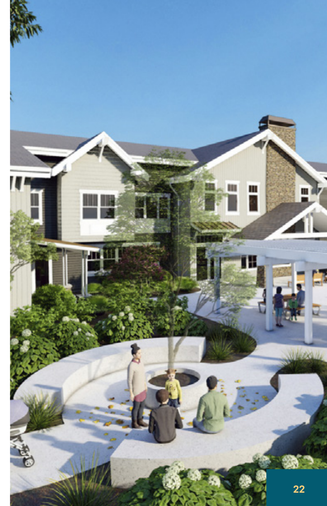
Prospect View in Butte County

by August 1. As of October 15, 2021, seven NPLH projects have completed construction and are in the process of renting up 202 NPLH units. A snapshot of tenant outcome data for three of these projects for which data has been received is summarized below. Additional tenant outcome data for these three projects for the factors listed above is in Appendix 5. Tenant outcome data for other NPLH completed projects will be posted on the NPLH webpage as this data comes in and the reports are reviewed.