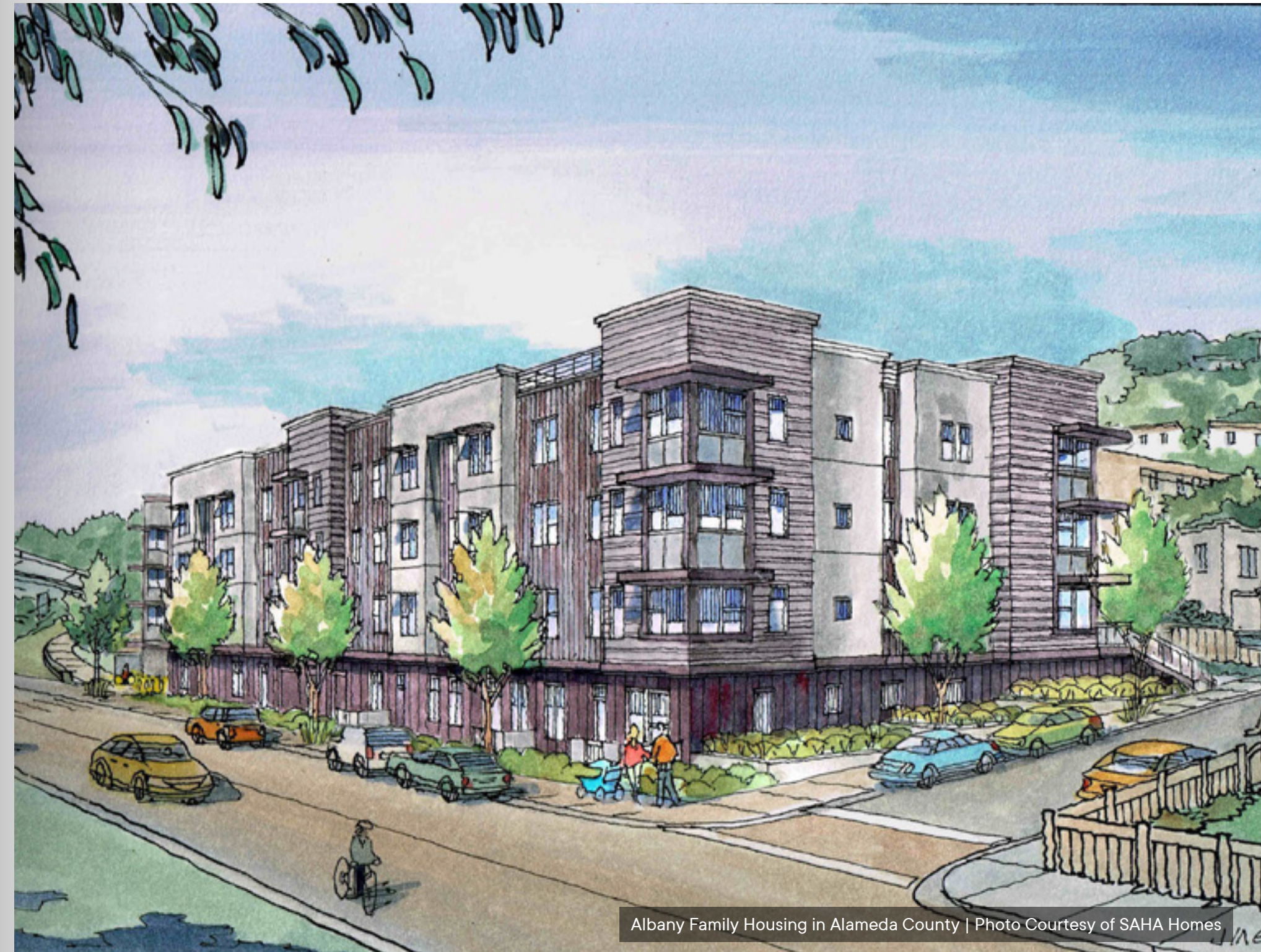
Albany Family Housing in Alameda County | Photo Courtesy of SAHA Homes