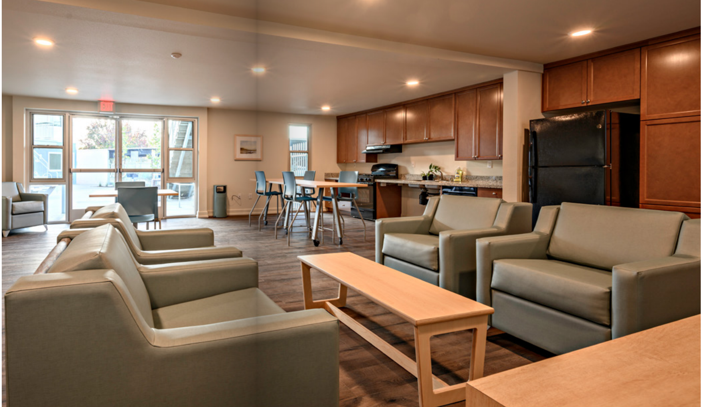
Villages at Paragon in Fresno County

HCD looks forward to continued work within NPLH in order to serve California's most vulnerable populations of persons living with serious mental illness who are homeless or exiting institutional settings. Questions regarding the information provided in this report can be directed to nplh@hcd.ca.gov .