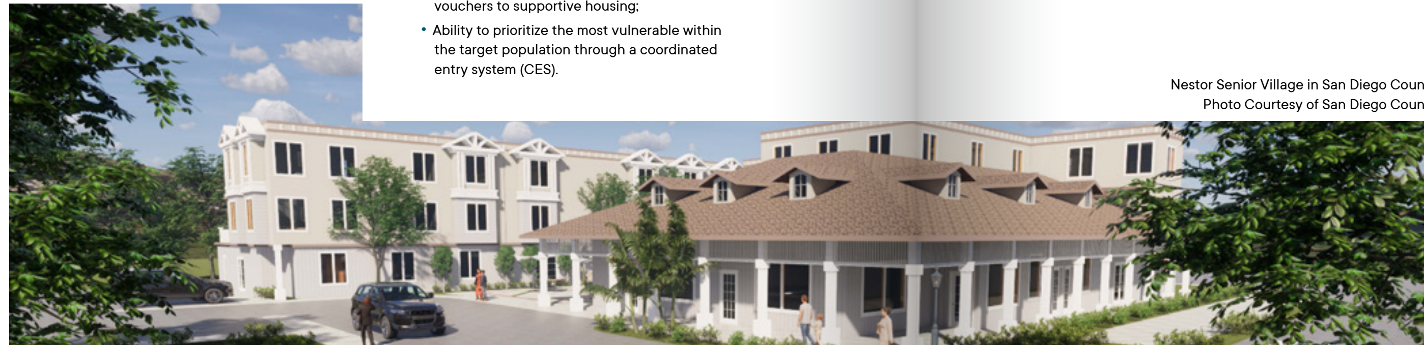
Nestor Senior Village in San Diego County