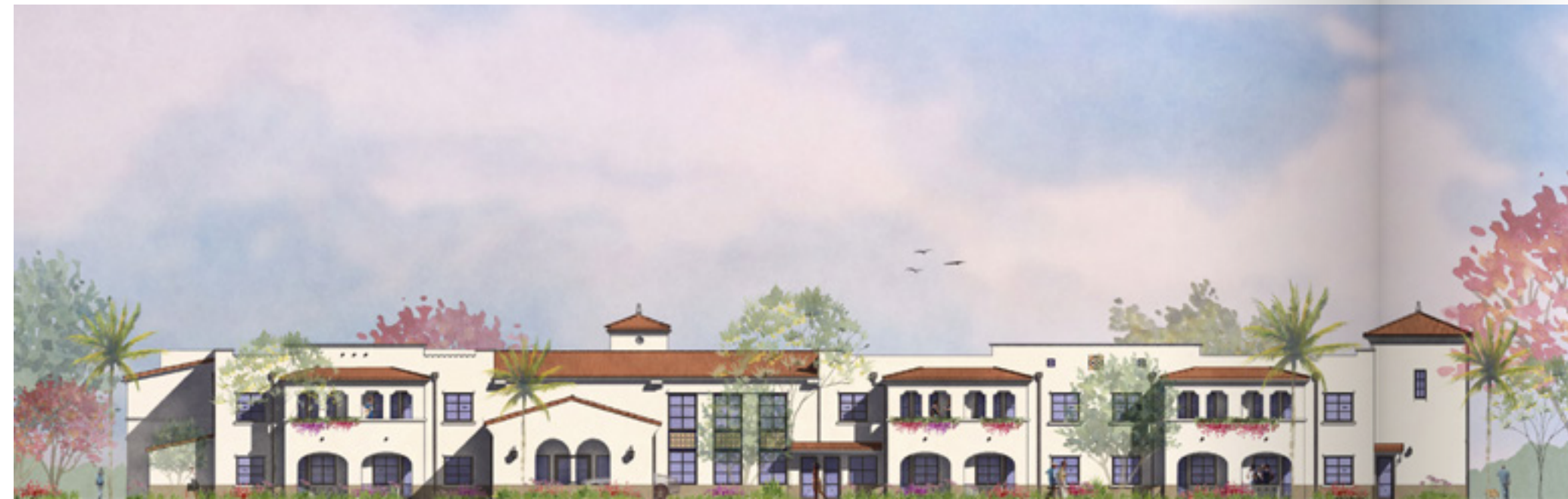
Rancho Sierra Senior Apartments in Ventura County

NPLH also anticipates at least another 36 projects to start construction over the next 6-12 months. This includes 8 BOS NPLH projects that submitted applications for Tier 1 funding under the California Housing Accelerator Program . The Department estimates that 50 NPLH-funded projects will complete construction in FY 21-22.